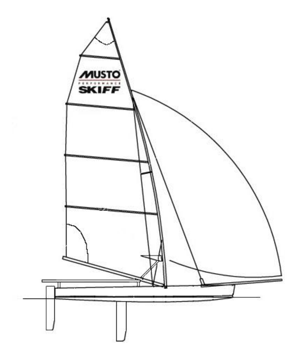
Figure 2.1 : Profile